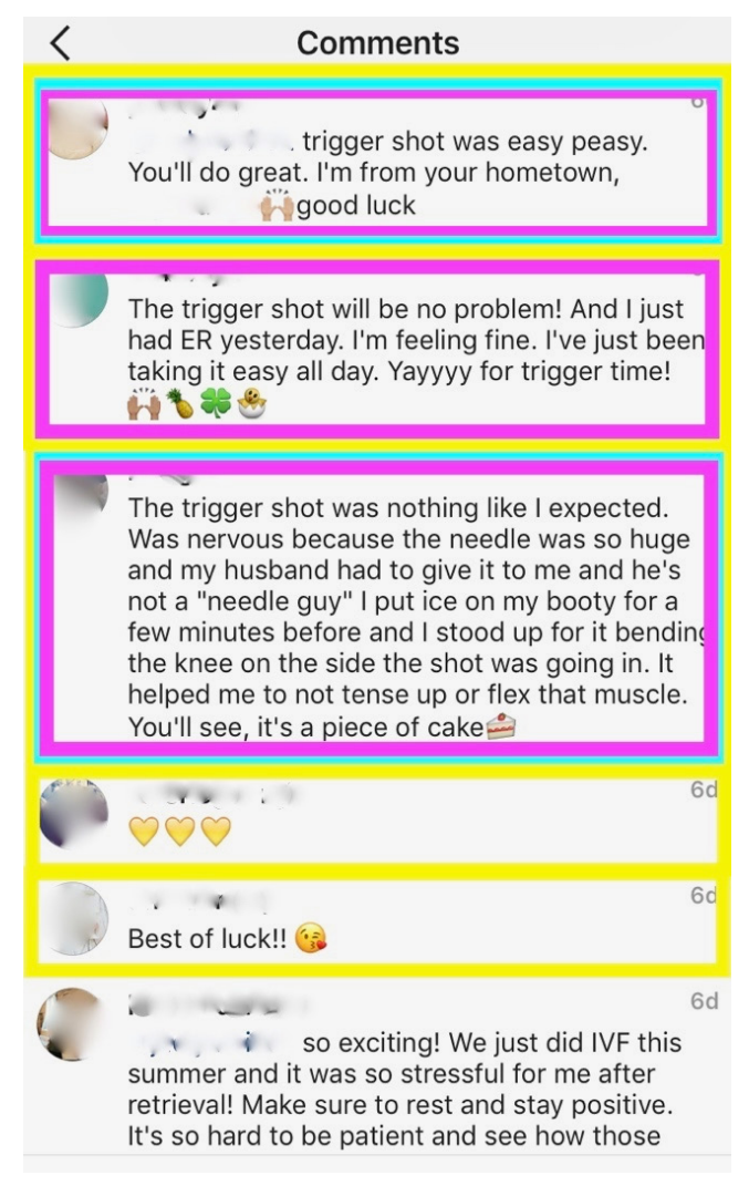
Figure 2. Comment Coding: Emotional (yellow), Informational (blue), and Belonging (purple). Comments are marked with their corresponding color codes. Top comment is coded with all three colors; second comment is coded yellow and purple; third comment is coded with all three colors; bottom two comments are coded with yellow only.