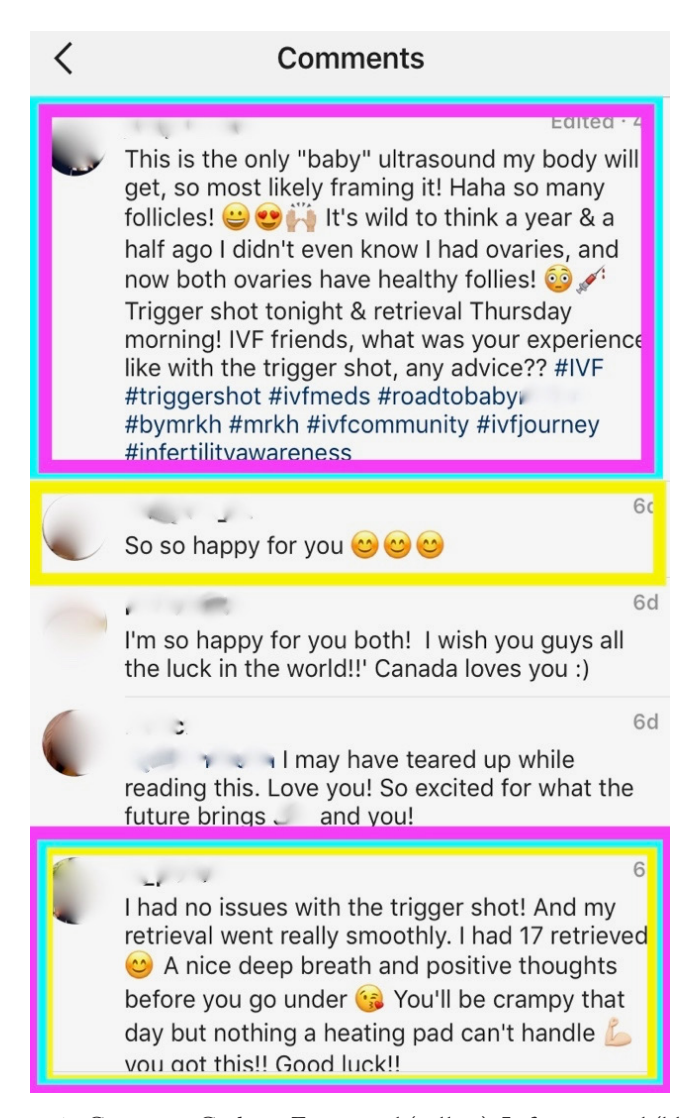
Figure 1. Comment Coding: Emotional (yellow), Informational (blue), and Belonging (purple) Comments are marked with their corresponding color codes. Top comment has blue and purple; middle is coded with yellow; bottom is coded with all three, yellow, blue, and purple.